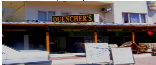
Disabled facilities in Quenchers bar