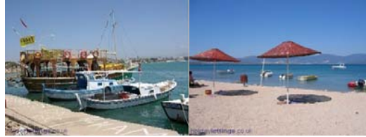
Altinkum harbour one of many beaches