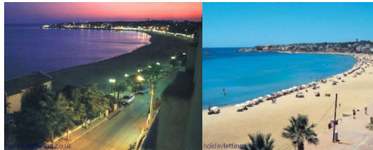
Altinkum Night and Day