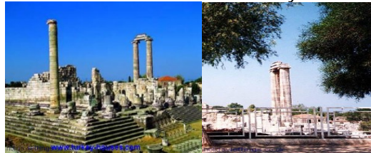
Temple of Apollo Didim